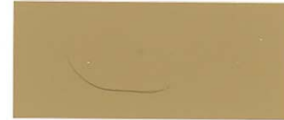
Mocha Tan (22)